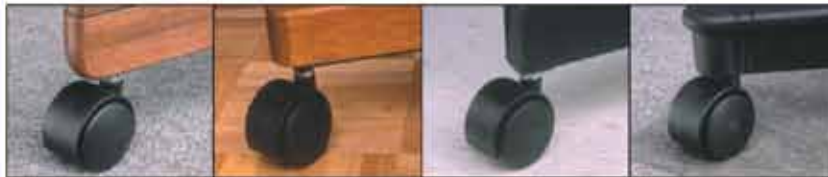
For use on carpeting: Order hard wheel casters. For use on hard floors: Order soft wheel casters. For use on linoleum (vinyl): Order soft wheel casters. For use on chair mats: Order soft wheel casters.